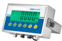
AE 403 Indicator