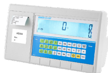
AE 504 Indicator