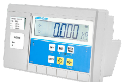
AE 503 Indicator