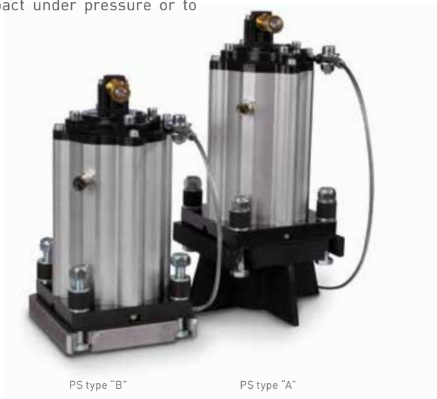
PS type "B"

adhere to the walls, as well as the majority of granular and bulk materials. For this reason the PS series products represent the ideal solution to the problems of formation of bridges and mouse holes.